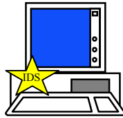
Figure-1. Computer System

The arrows represent the monitoring functionality of the IDS as opposed to the implementation of the computer network.