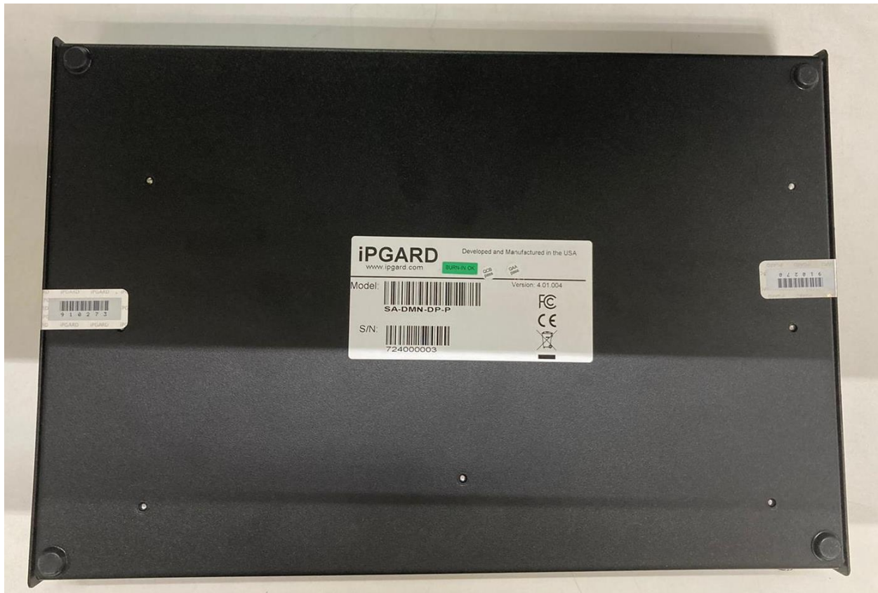
The following image is a close-up of the label from the previous image.