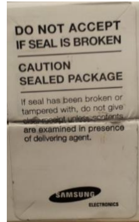
Figure 4 - Security Seal (White)