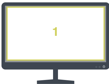
Full Screen mode: